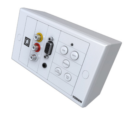
Connectivity + IR Control Module