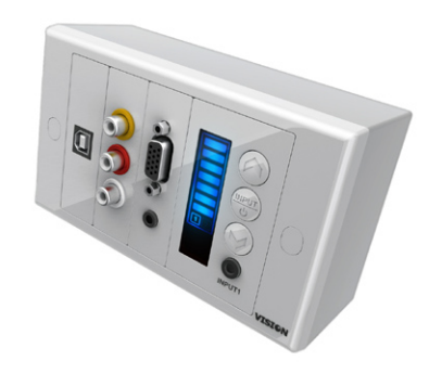
Connectivity + 2 x 25w Amplifier Module