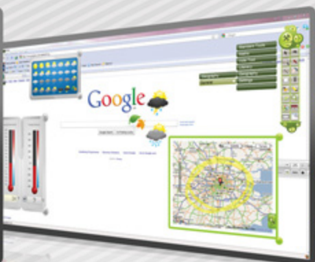
WizTeach Over A Browser