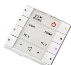
Neets Control - SieRra II

8-button keypad 3 x I/O 1 x Ethernet port (10 devices) 1 x NEB port 3 x RS-232 1 x NEB port (5 devices) E-mail notification Power over Ethernet (PoE) Webserver Touch Control with tablet