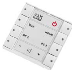
Neets Control - Echo Plus

8-button keypad 3 x I/O 1 x Ethernet port (2 devices) 1 x NEB port 2 x RS-232 1 x NEB port (2 devices) E-mail notification