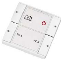
Neets Control - OsCar

4-button keypad 2 x I/O 1 x Ethernet port 1 x RS-232 E-mail notification