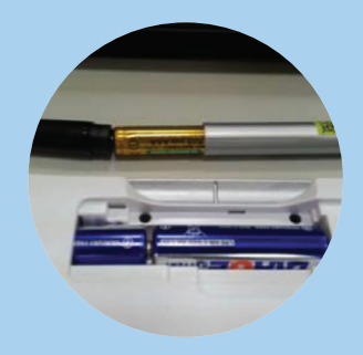
Insert Batteries Insert batteries into stylus and AirPad