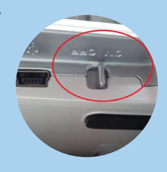
Turn On Turn on the AirPad Power