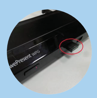
Connect Remove USB Dongle from battery compartment of AirPad and insert into the front USB port of the WiPG-2000